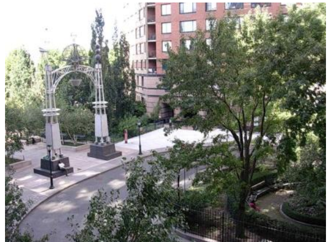
Direct Park Views