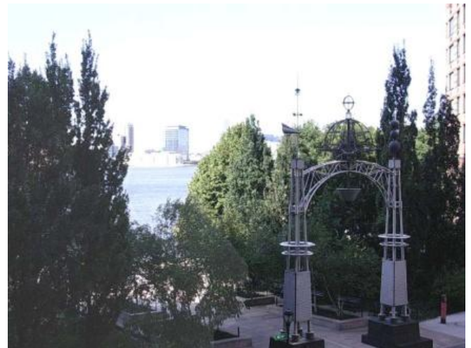
River Views From Balcony