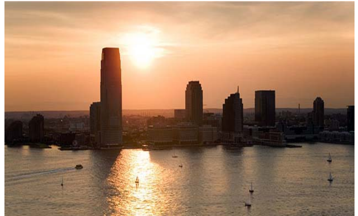
Spectacular World Class Views