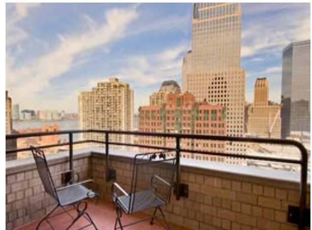
Open Northern City Views + Balcony