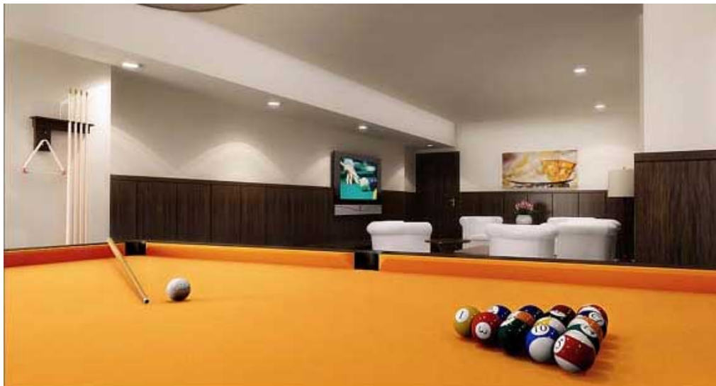
The Billiards Lounge