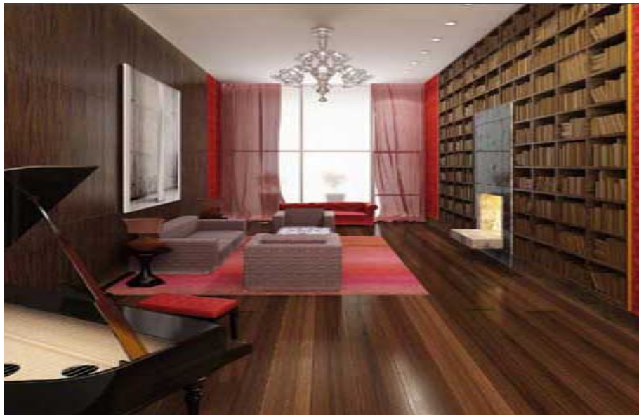
Rendering of Library