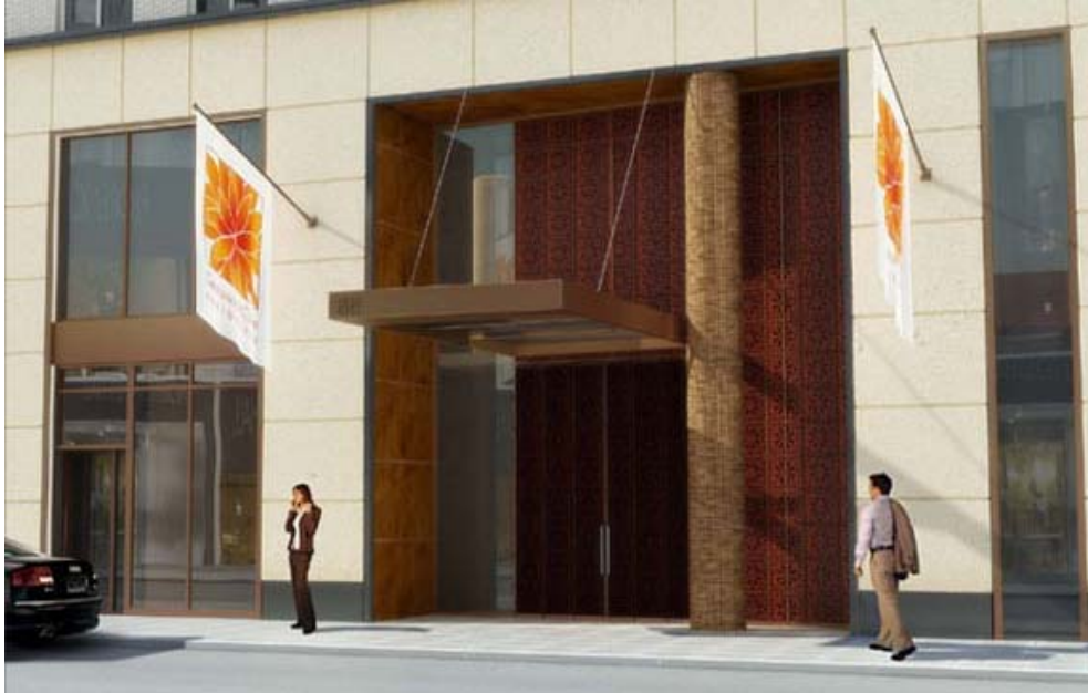
Rendering of Building Entrance