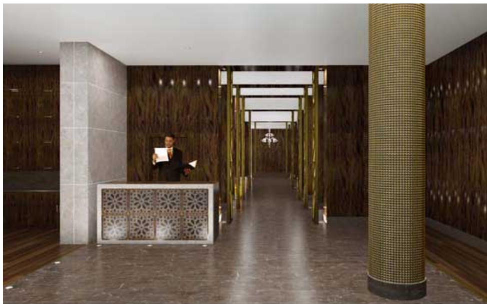
Rendering of the Building Lobby