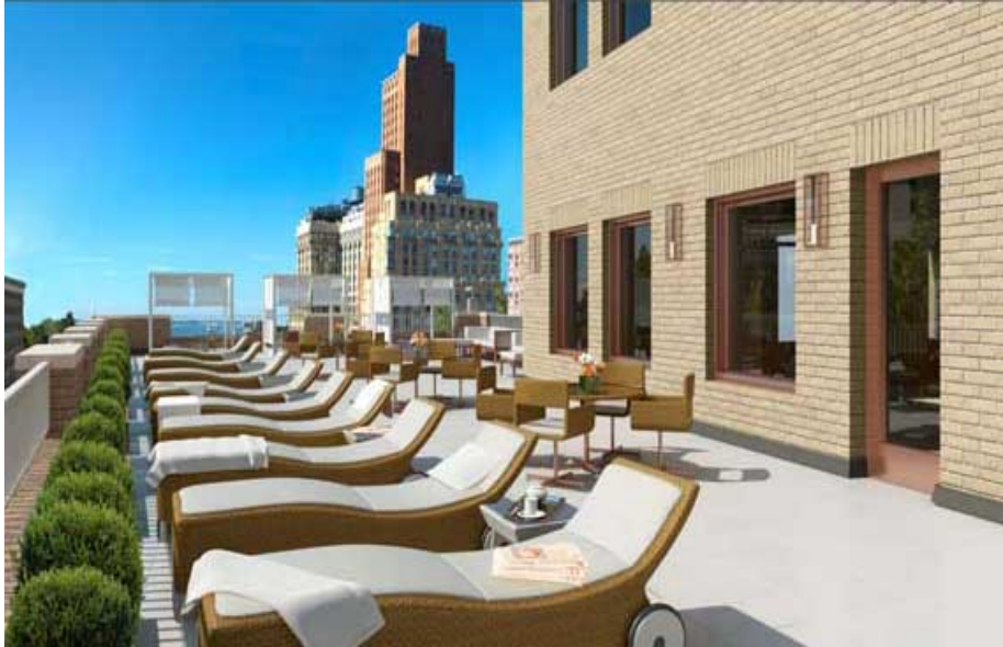
Rendering of Roof Terrace