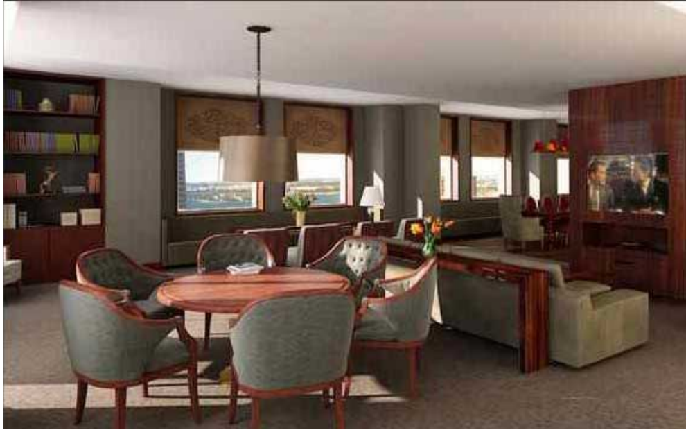
Residence Harbour Lounge