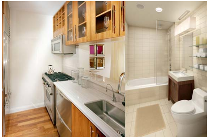
Kitchen & Bath Finish: The Hudson