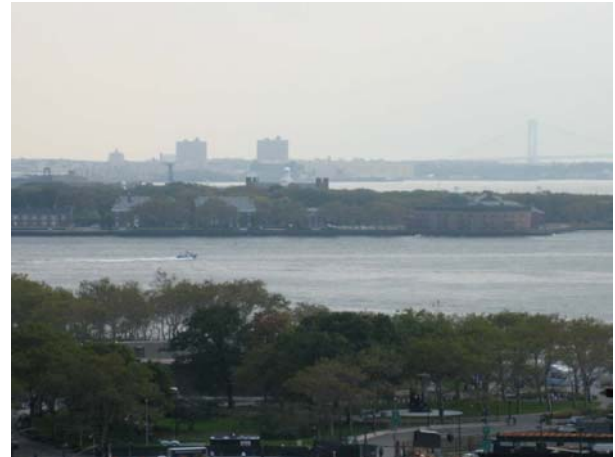
South View From Balcony